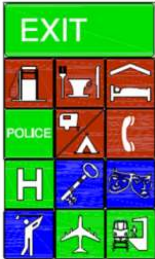
Typical Main Line Sign

Note: Main Line sign has to be 3 signs across.