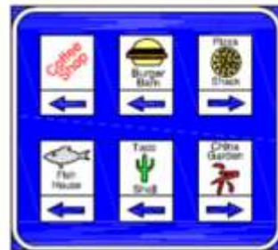
Sample Off-Ramp Sign 10'-0" x 9'-0"