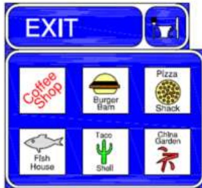
Sample Main Line Sign 13'-0" x 9'-0"