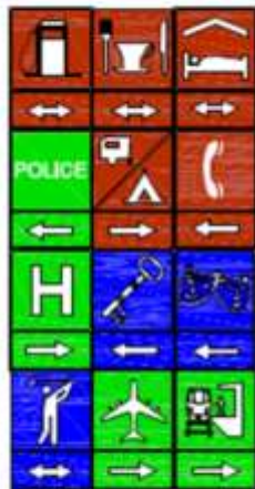
Typical End of Ramp Sign

Note: Main Line sign has to be 3 signs across.